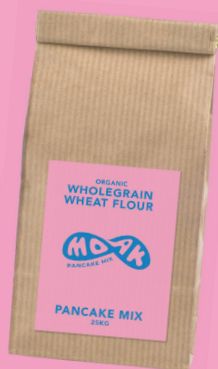
Moak pancake mix 4,95 EU