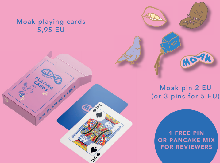
Moak playing cards 5,95 EU