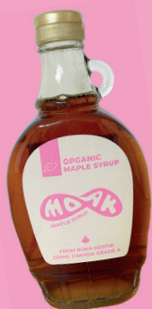
Moak maple syrup 9,95 EU