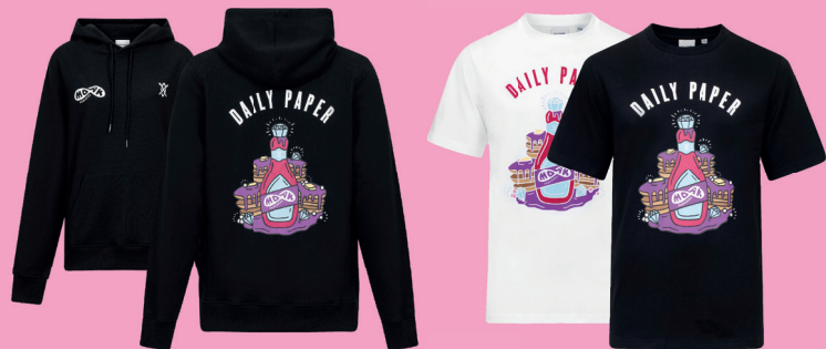
Daily Paper x Moak hoodie 119,95 EU